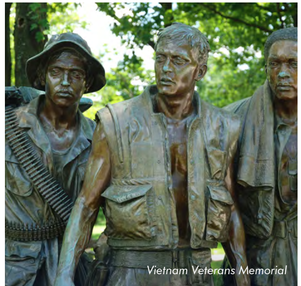
Vietnam Veterans Memorial