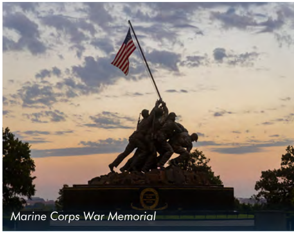
Marine Corps War Memorial

Our journey to the nation's capital begins as we board our flight in Fargo and set off for an inspiring and memorable adventure in Washington, D.C. Upon arrival, we'll transfer to the Hyatt Place Washington DC/White House , where we'll enjoy a comfortable five-night stay in an unbeatable location—just steps from the White House and within easy reach of the city's most iconic landmarks. After settling in, gather with fellow travelers for a special welcome dinner, the perfect opportunity to connect, unwind, and share in the excitement of the days ahead. With its renowned monuments, world-class museums, and stories that shaped a nation, Washington, D.C. promises an unforgettable experience.