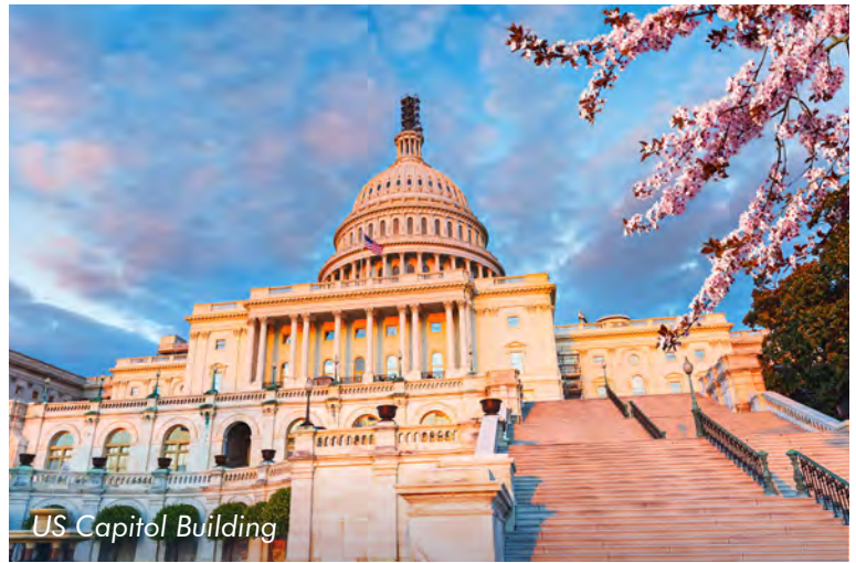
US Capitol Building