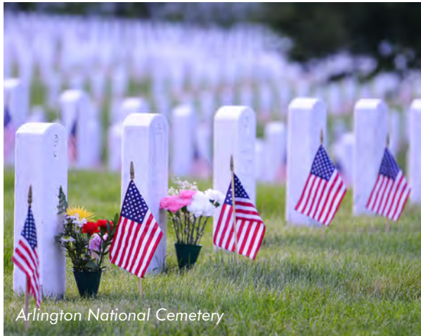
Arlington National Cemetery