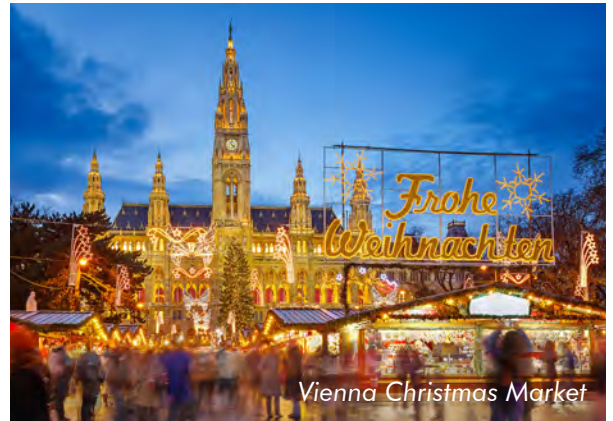
Vienna Christmas Market