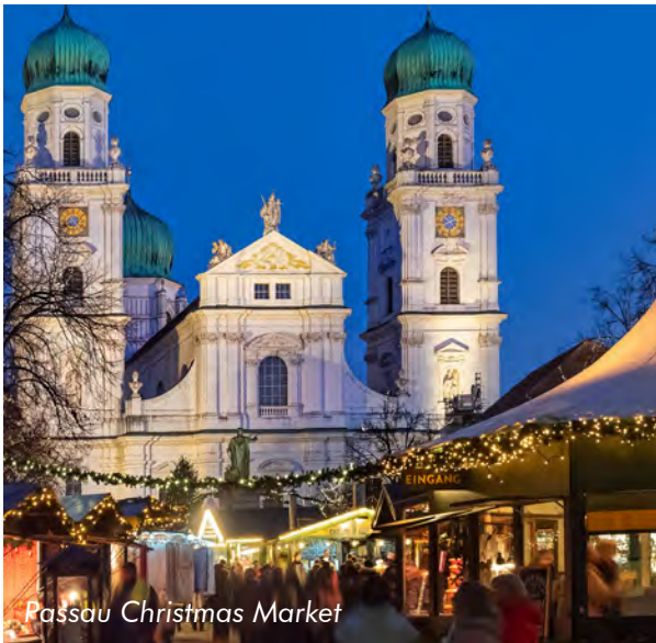
Passau Christmas Market

DiscoverMORE: Bavarian Traditions (extra expense)