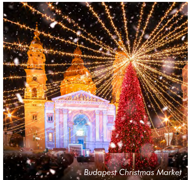
Budapest Christmas Market